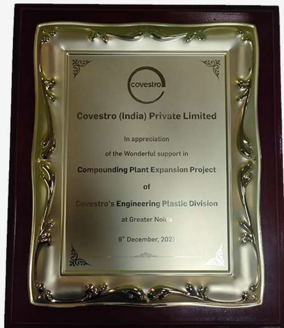
Appreciation Award received from Covestro India