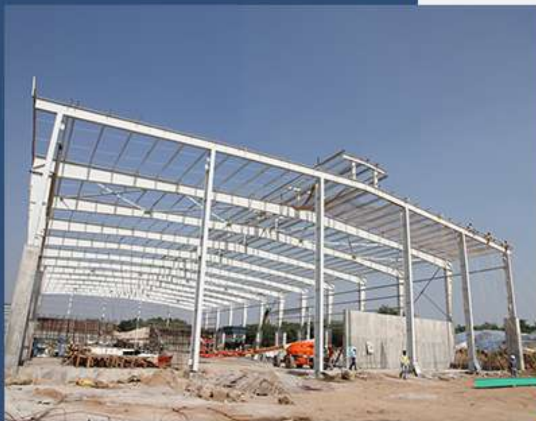
AMBUJA CEMENT LTD ASR STORAGE BUILDING Pali, Rajasthan Clear Span building of 40 m