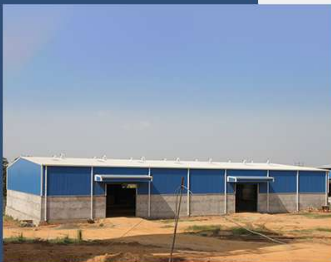
JK WHITE CEMENT LTD WAREHOUSE BUILDING Katni, Madhya Pradesh