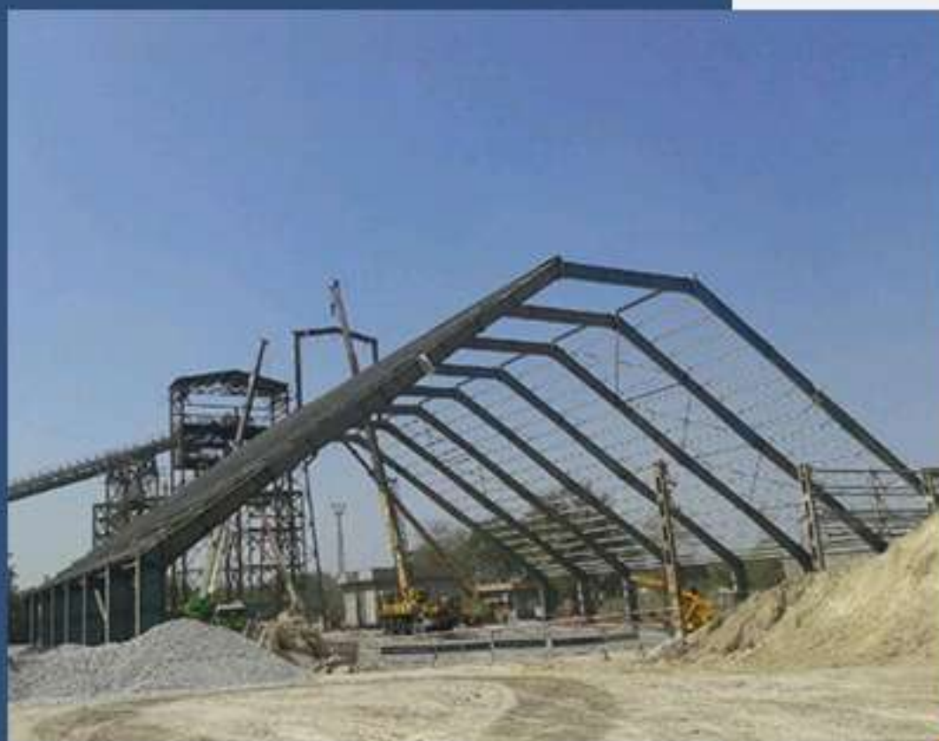
ULTRATECH CEMENT LTD GYPSUM HANDLING SHED Khor, Madhya Pradesh Clear Span building of 50 m