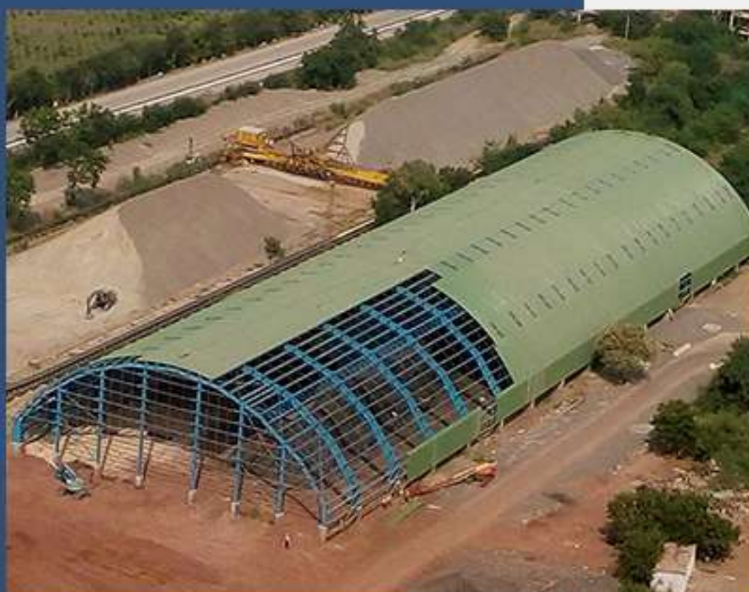
MANGALAM CEMENT LTD COAL HANDLING SHED, STACKER & RECLAIMER SHED, ADDITIVES SHED & FLY ASH YARD SHED

Morak, Rajasthan Clear Span building of 60 m