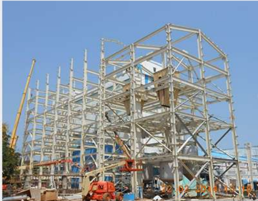
HINDUSTAN UNILEVER LTD G+6 STOREY PROCESS BUILDING Pondicherry Height: 31m