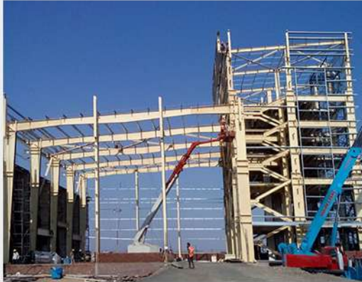
RUDRAKSH DETERGENT & CHEMICALS PVT LTD G+5 STOREY PROCESS BUILDING Gujarat Height: 23m