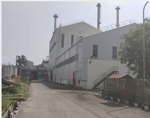
GOODYEAR INDIA LTD MANUFACTURING UNIT Aurangabad, Maharashtra Height: 23m