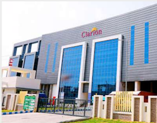
LOTUS BEAUTY CARE PRODUCTS PVT LTD G+2 PROCESS BUILDING Haridwar, Uttarakhand Height: 18m